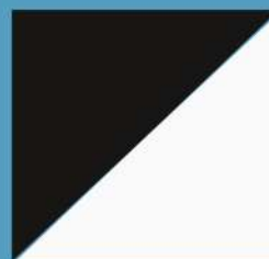
Black Out/ White In