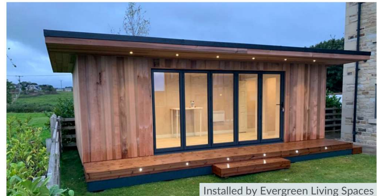
Installed by Evergreen Living Spaces