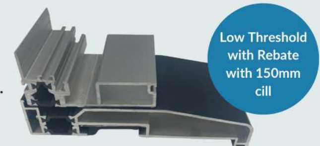
Low Threshold with Rebate with 150mm cill

A 20mm rebate can be attached to our low threshold, making it only slightly higher at 40mm. The lip of the rebate gives extra weather protection against the elements.