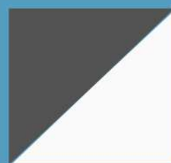
Grey Out/ White In