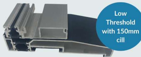
Low Threshold with 150mm cill