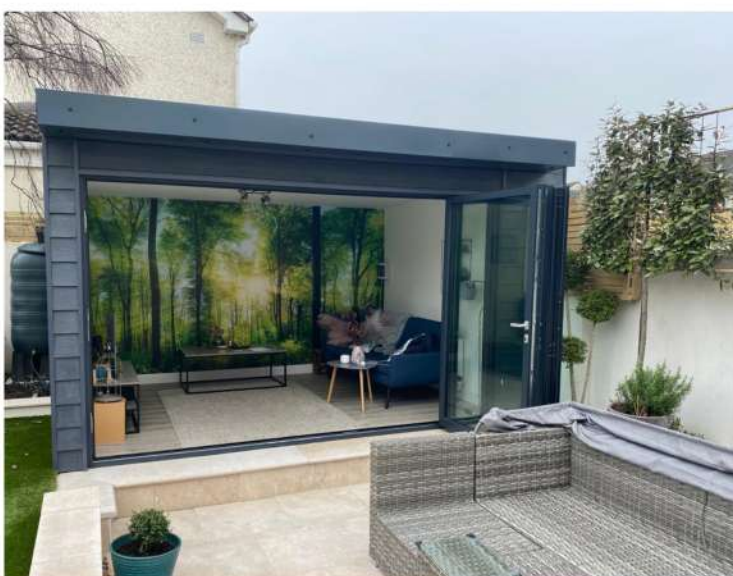
Installed by Luna Door & Window Design