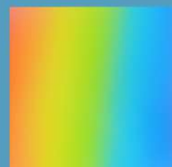
Bespoke RAL colour